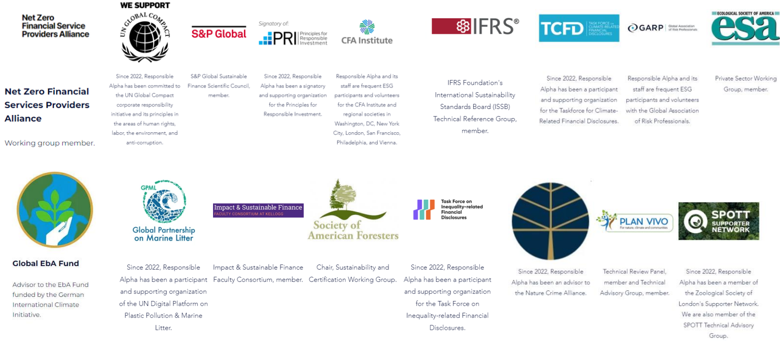
Figure: Responsible Alpha's Leadership Roles 2023